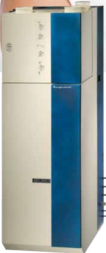
The Passive House Appliance

For sustainable heating domestic hot water